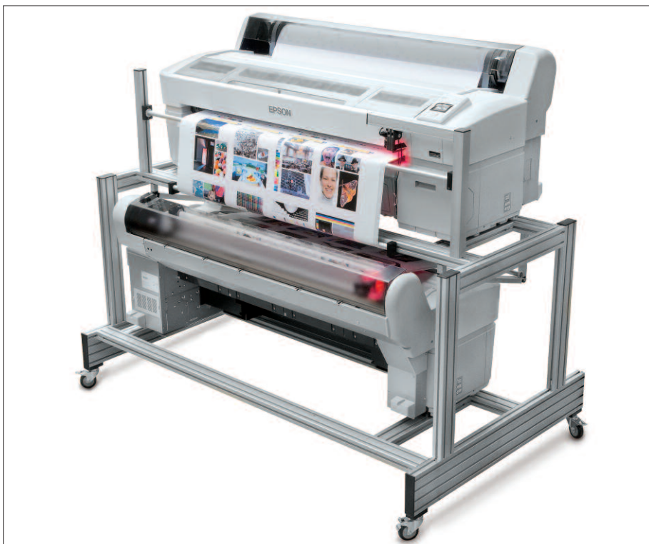
The new DJet is capable, for example, of printing up to 40 double-sided printing blocks of 70 x 100 cm (8-up) per hour.

With the launch of DJet, Digital Information is ahead of the curve on a phenomenon that has been hitting the graphics industry in a big way since the 1990s. Technologies that were originally developed for a consumer market are replacing specialized, very expensive machines at a fraction of the cost. This trend began with the introduction of the PC and user-friendly software which led to the erosion of the established typesetting and image process systems. Soon thereafter, the trend hit proofing systems, which were replaced by cost-effective Inkjet systems whose technology was first tried and true in the consumer arena. Taking the curve a step further, as Inkjet technology has become increasingly more sophisticated, Inkjet printers used for proofing have been gaining in the area of print production speed and are now adequate to be used as production printing systems. The DJet sets the bar high for a revolutionary, low-cost digital press that functions as an imposition proofing system, as well.