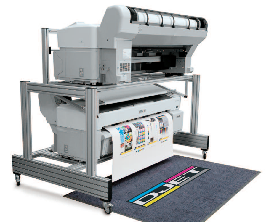
Equipped with the latest electronic/software innovations, the DJet has minimal mechanical parts

variety of print substrates. Hence, it is possible to use some uncoated FSC certified papers with a grammage of 90 gms to 250 gms per square meter without having to pre-treat them with a primer.